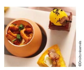
Buffets and standing cocktails