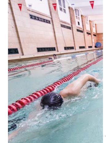
A 25 m x 9 m swimming pool with 4 water lines located in the heart of the campus in the International House (180 people).